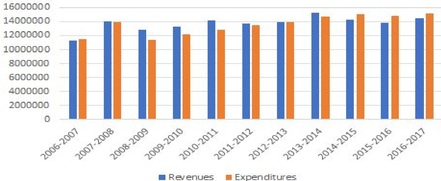
Revenue vs. Expenditures Trend 2007-2017